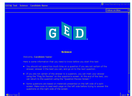
Yellow on blue