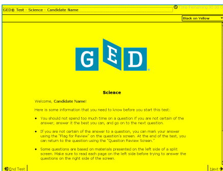
Black on yellow

Here are a few of the text and background color combinations you can choose from on your 2014 GED® test. Click here to see all available color combinations.